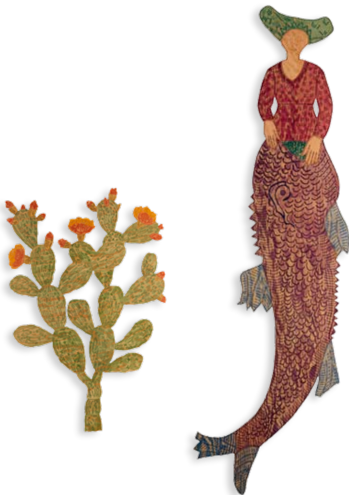
Digital wood engravings Oregon veneer on hoop ply, oil paints, Danish varnish left to right:

Hedging Dreams (of Prickly Pear) , 2009 110 x 74cm