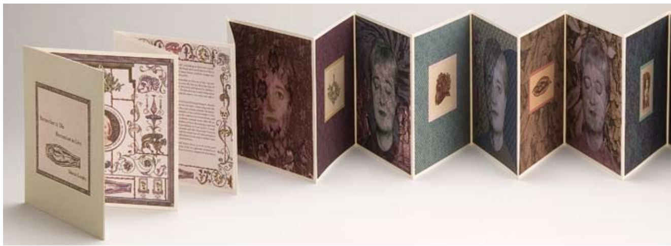
Remember to Die, Remember to Live , 2008 concertina artist book, inkjet prints on Hahnemühle Photo Rag 188gsm paper book closed 21 x 21cm, open 21 x 378cm detail below, left