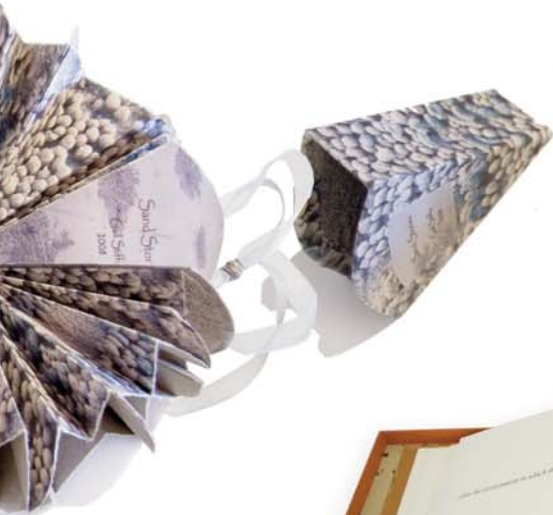
Gail Stiffe: Sand Stories