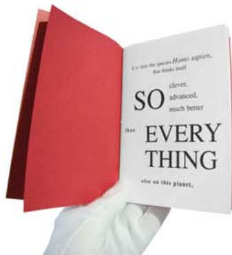
Monica Oppen: Botanikos (little red book detail)