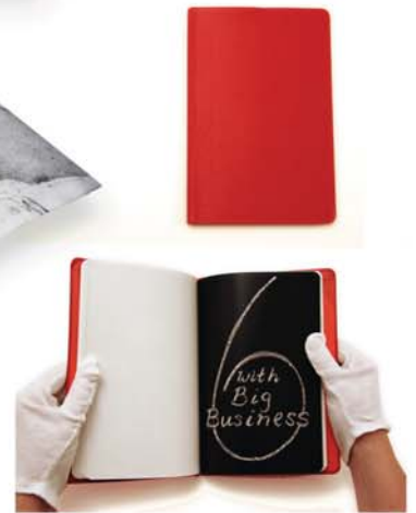
Peter Lyssiotis: 7 Disrupted Interviews with History