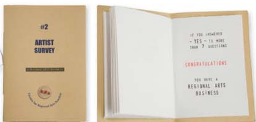
Spowart+Cooper: #2 Artists survey - A regional arts business