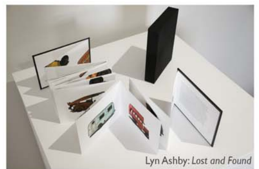
Lyn Ashby: Lost and Found