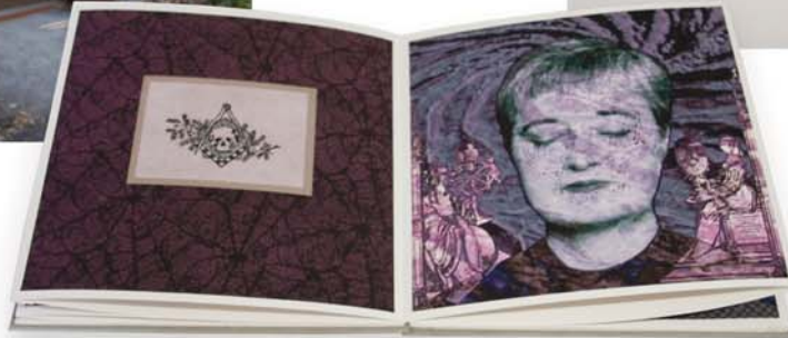
Dianne Longley: Remember to die, Remember to live