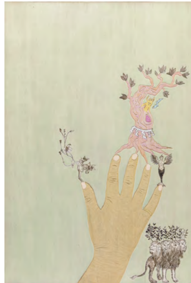
Dianne Longley Tree Spirit , carved Jelutong panel with pokerwork, oil paint, gold leaf, 30 x 42cms, 2007