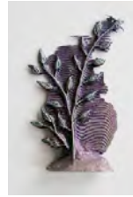
Dianne Longley Traces of Wind , Pewter, oil pigments, 6.5 x 5 x 2cms, 2007