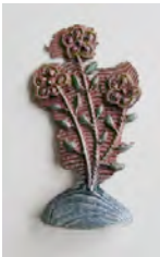
Dianne Longley Joyful , Pewter, oil pigments, 7.5 x 5.5 x 2.5cms, 2007