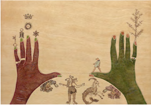
Dianne Longley Crossing Over , carved Jelutong panel with pokerwork, oil paint, gold leaf, 30 x 42cms, 2007