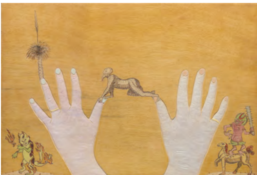
Dianne Longley Bridge , carved Jelutong panel with pokerwork, oil paint, mica pigments, wax varnish, gold leaf, 30 x 42cms, 2007