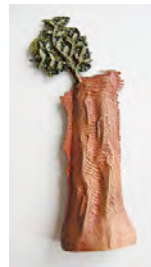
Dianne Longley Withstand , Bronze, oil pigments, 12.5 x 5.5 x 2.5cms, 2007