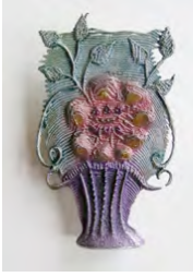
Gift , Pewter, oil pigments, 9.5 x 6 x 2.5cms, 2007

Dianne Longley - List of Works (selected for website) - Spirited Away , Adelaide Central Gallery, SA - 2007