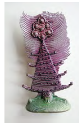
Dianne Longley Wistful , Pewter, oil pigments, 9.5 x 7.5 x 2.5cms, 2007