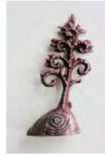
Dianne Longley Strangeness , Bronze, oil pigment, 7 x 5.5 x 2.5cms, 2007