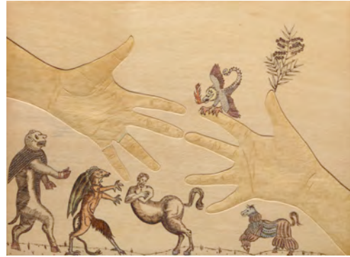
Dianne Longley Gesture , carved Jelutong panel with pokerwork, oil paint, mastic varnish, gold leaf, 30 x 42cms, 2007