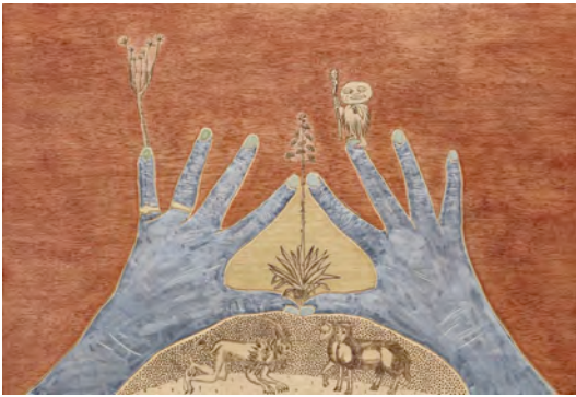
Dianne Longley From Darkness , carved Jelutong panel with pokerwork, oil paint, gold leaf, 30 x 42cms, 2007